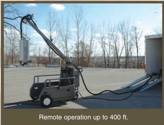
Remote operation up to 400 ft.