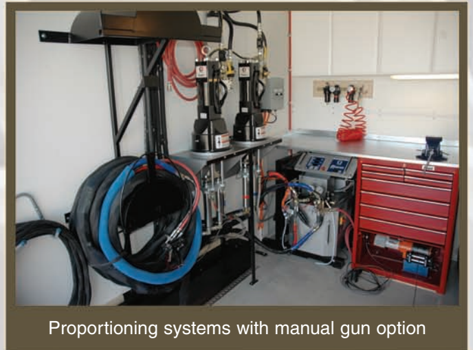
Proportioning systems with manual gun option