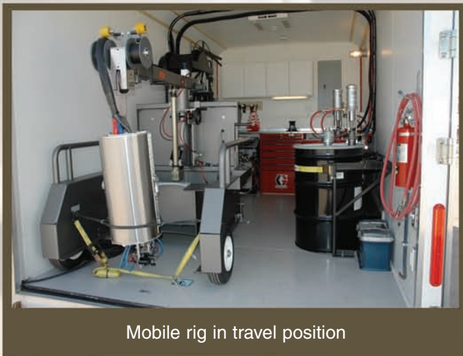
Mobile rig in travel position